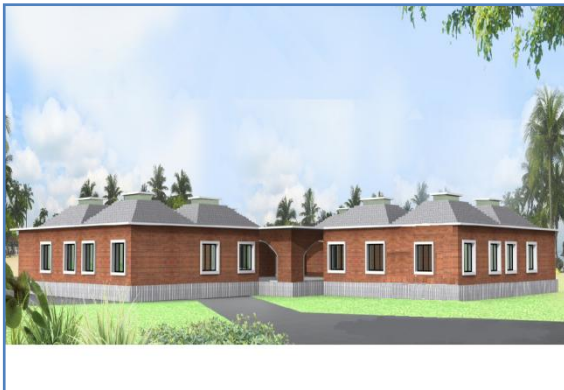
School Premises in Gurukool version

PSN is perpetually committed to provide best education matching global standards, thereby contribute to social progress and up-liftment of rural children, who otherwise are deprived of basic education. No fees are charged from the under-privileged children and School ensures that teachers & students are picked up/dropped back free-of-charge.