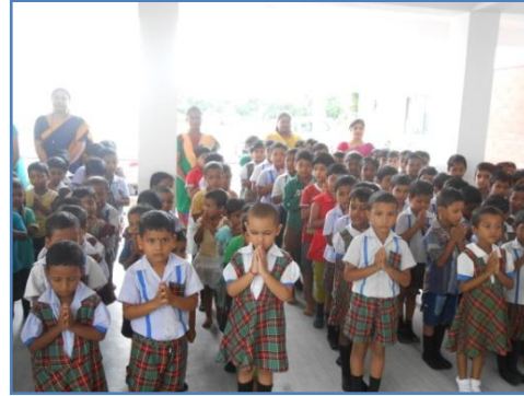
Morning Prayer – keeping up with rich Indian tradition