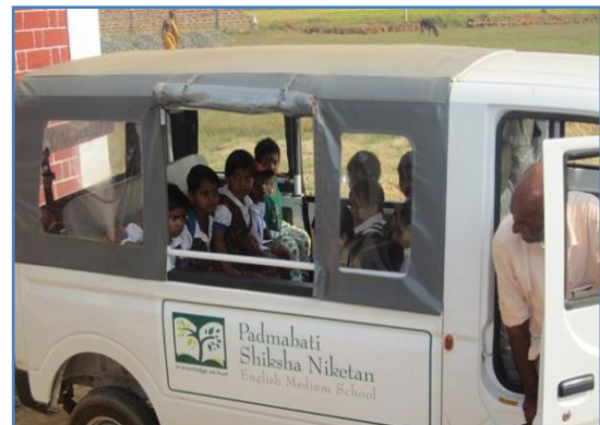
Free pick-up and drop