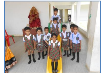
Day Activities of little ones