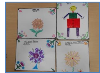
Adoring crafts & drawings by little hands