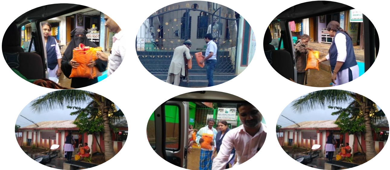
New Winter Wears being distributed by Dharwad colleagues to differently-abled under-privileged to give protective shield from the harsh winter.