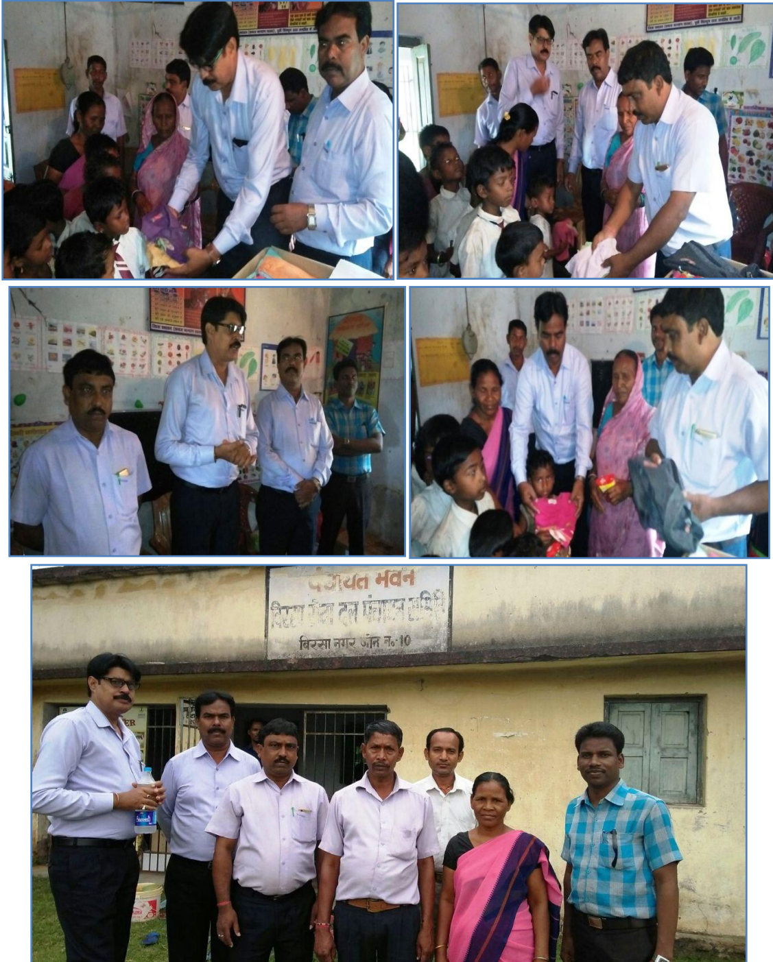
Jamshedpur CSR colleagues distributing clothes and sweet meats to destitute children of Christian Missionary Welfare Centre at Baridih and Birsanagar, rural Jharkhand