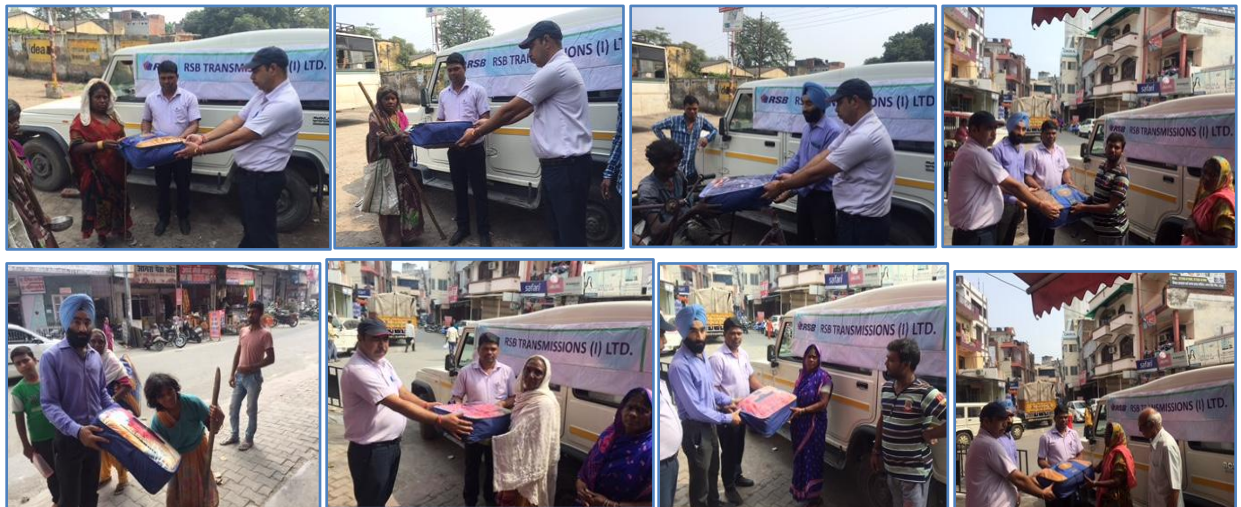
CSR Team from RSB, Pant Nagar, distributing winter wears to poor under-privileged who live on road side without roof.