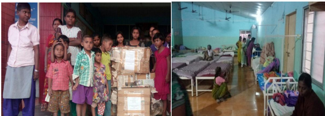
Distribution of Wears to destitute children and aged at Maher Vatsalyadham, Pune