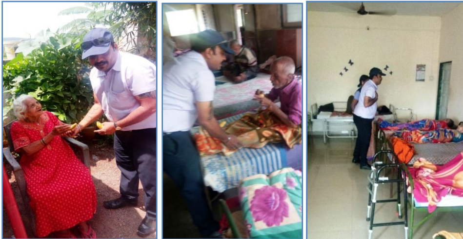
Distribution of Sweets, Fruits and Snacks to inmates of Kinara Vridashram by our CSR Team Member