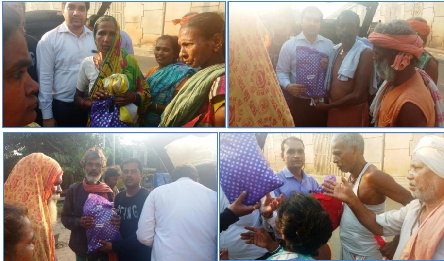
Mania colleagues distributing wears to under-privileged living on road-side