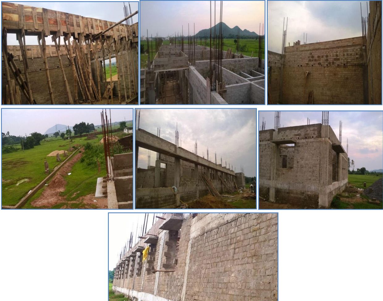
Construction work in progress as part of expansion (March 2017)