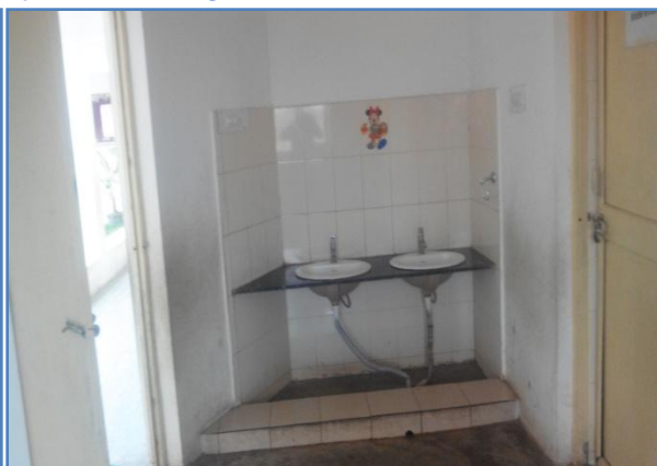
Hygiene at its best to keep the health of students agile and active