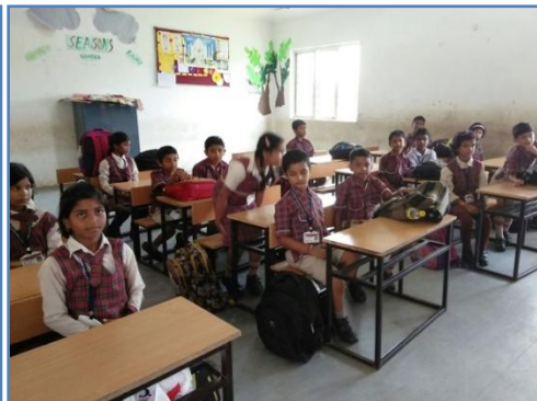
Joy of Learning