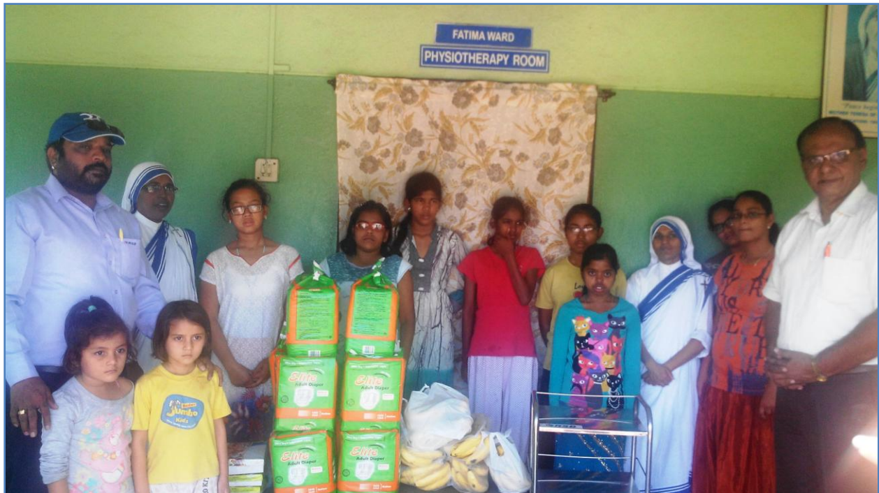
Formal handing over Trolley, Diapers and Cupboards to Sisters of Prerna Bhavan