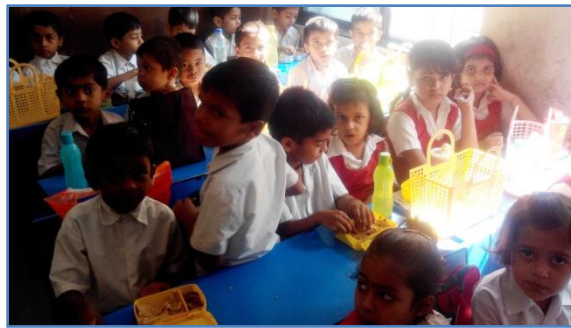
Tiny Tots enjoying snacks in a clean & hygienic environment