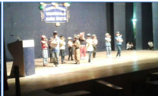
Under-privileged students performing stage drama on the eve of Annual Day