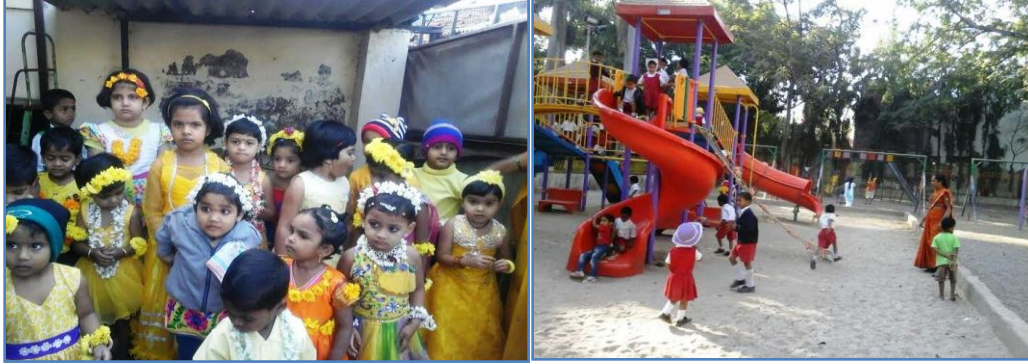
It's time for out-door fun-and-frolic for little have-nots