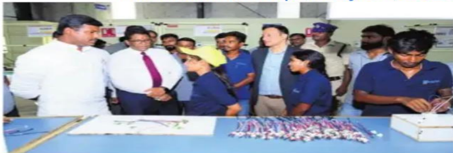
Minister of Industries Gudivada Amarnath visits Sri City on Tuesday | EXPRESS