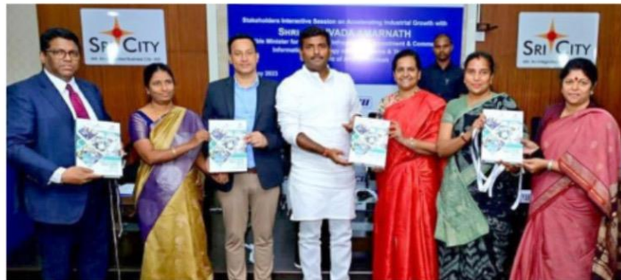
Minister for Industries Gudivada Amarnath releasing a copy of Sri City's social impact study conducted by the faculty members of SPMVV, at Sri City in Tirupati district on Tuesday.

standing (MoUs) were signed with six companies viz., NGC, TIL Healthcare, Magnum, Evershine Moulders, Bombay Coated Special Steels and BVK group. The cumulative proposed investment was pegged at around ₹500 crore, generating employment to 1,500.