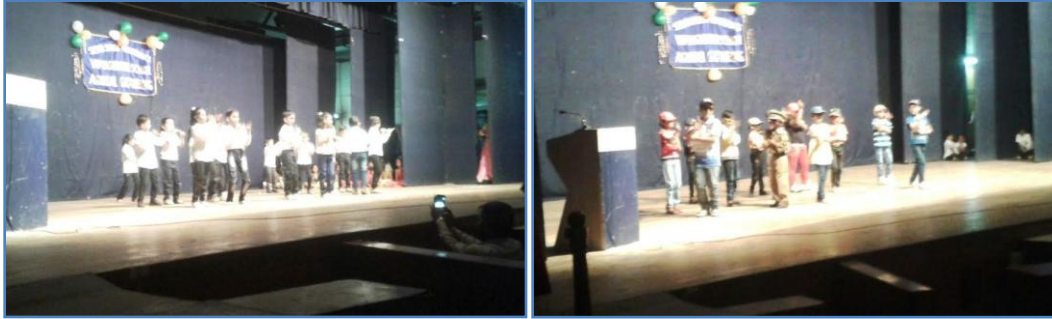
Under-privileged students performing stage drama on the eve of Annual Day