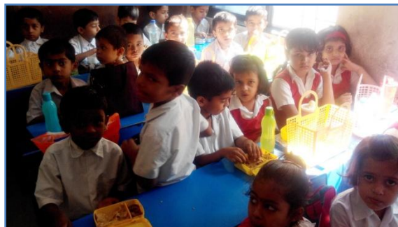
Tiny Tots enjoying snacks in a clean & hygienic environment