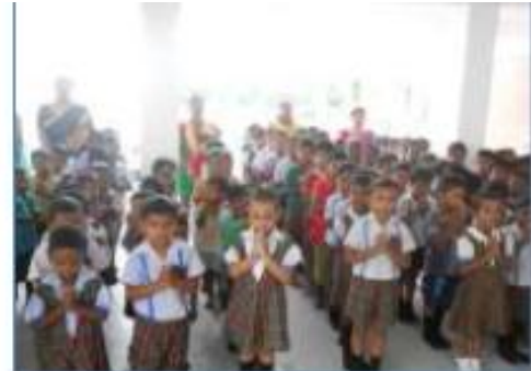
Morning Prayer – keeping up with rich Indian tradition