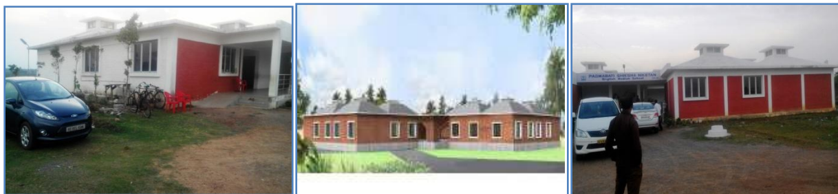
Padmabati Shiksha Niketan - School Premises(frontal view) in Gurukul Version