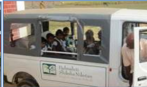
Pick-up and drop at door step