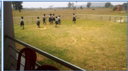
Separate steel-barricaded mini ground for fun-and-play for tiny tots of LKG/UKG