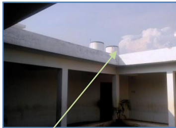
Overhead tank–Clean Water