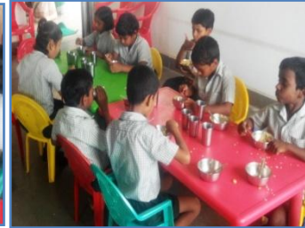
Students cherishing mid-day meal