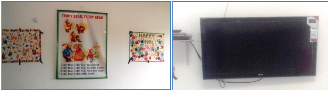
Few of well-designed posters around class room walls with dedicated LED TV for e-mode teaching to penetrate grasping at the root.