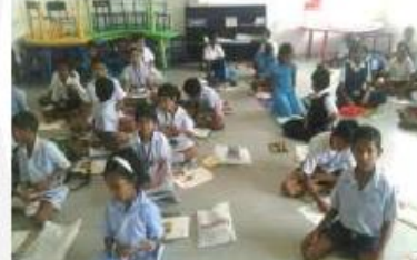
Day Activities of little ones