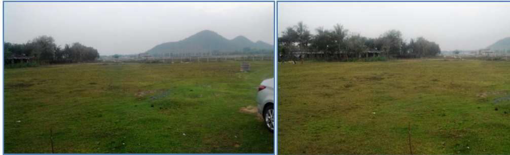
Lush green surrounding and large play ground for students